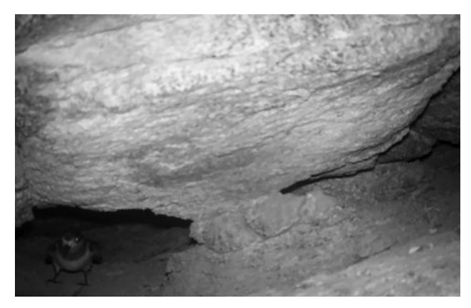
Hornby's storm petrel Oceanodroma hornbyi captured by a camera trap.

The only known colony of Hornby's storm petrel is in Pampa de Indio Muerto in the Atacama Desert, Chile,