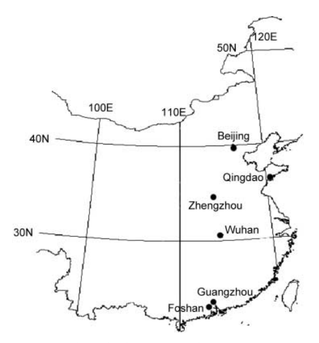
Figure 1 Localities of Culex pipiens samples in China in 2003.

Ester <sup>9</sup>, displaying over-produced esterases A9-B9 (Weill et al., 2001); and SB1, a resistant strain homozygous for Ester <sup>B1</sup>, displaying overproduced esterase B1.