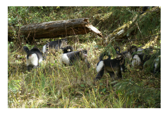
Figure 2 Yunnan snub-nosed monkeys travelling terrestrially in the Samage Forest, Yunnan.

Sitting was by far the most frequent postural state while feeding, as has been demonstrated for other colobines (Rose 1978; Gebo & Chapman 1995; McGraw 1998a). Suspensory behavior was shown as a means of